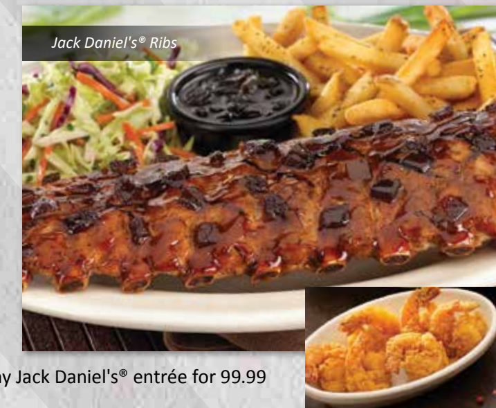
Jack Daniel's® Ribs

Fire-grilled and basted in our signature glaze with notes of toasted garlic, cayenne, Tabasco® Sauce and Jack Daniel's® Whiskey.