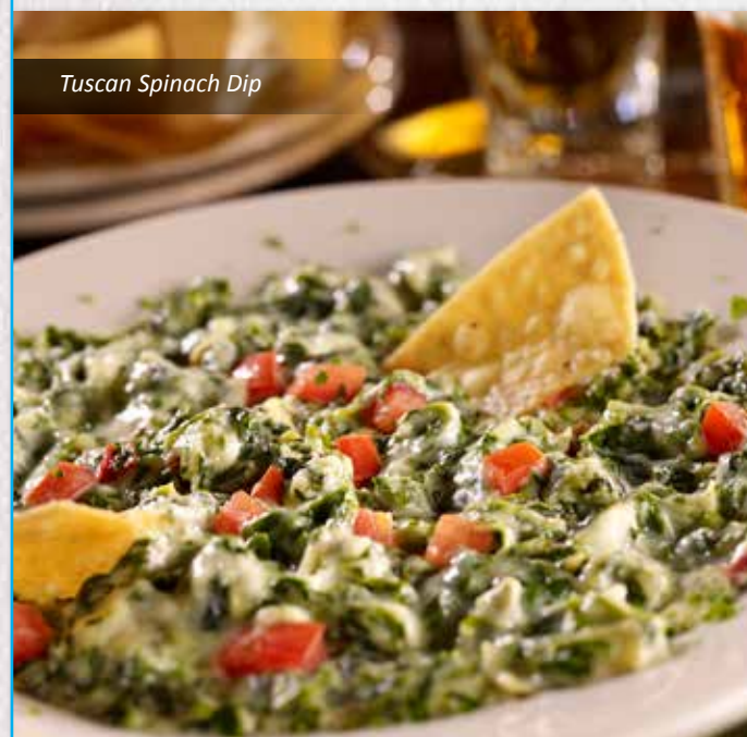
Tuscan Spinach Dip