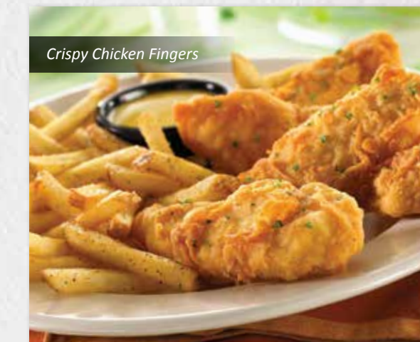
Crispy Chicken Fingers