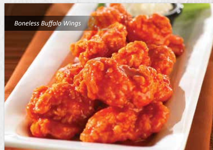
Boneless Buffalo Wings

Fridays™ signature – with melted cheddar and crispy applewood-smoked bacon. Served with green onion sour cream. 99.99